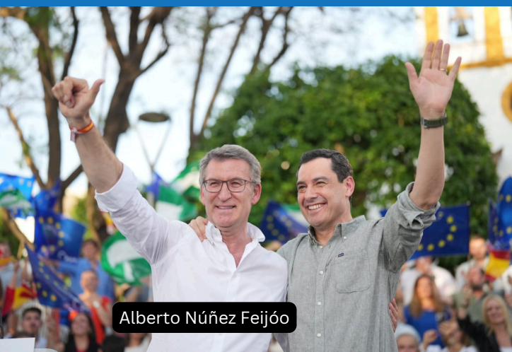
Alberto Núñez Feijóo

Born in Spain on May 1, 1970 Married and father to three children Awarded the Grand Cross of the Royal Order of Isabella the Catholic