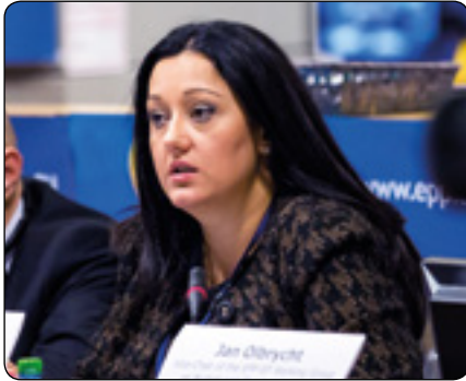
Liliana Pavlova , Minister for the Bulgarian Presidency

"We have set a goal to ourselves to respond to the needs of the citizens of Europe to the maximum extent – more security, more stability and more solidarity. The priorities we have set are part of the common European agenda"