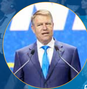
Robert Sighiartău, Secretary General of the PNL

"A better Europe starts at home, at local and regional level. The fight for a better Europe is our fight, the fight of all those for whom Europe is synonymous with peace, prosperity and liberty of all!"