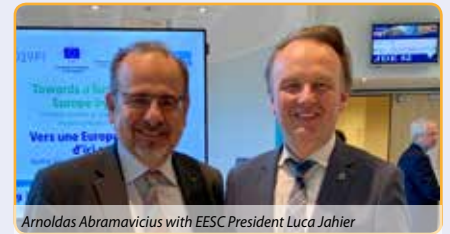
Arnoldas Abramavicius with EESC President Luca Jahier

for Climate: "We need to invent our future - that is what the future generations ask for. Forerunner activities such as the SDG 25+5 Cities are needed."