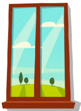
Europe based on local, regional and national realities