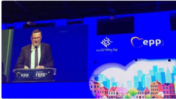
11:33 AM - 9 Mar 2018

We cannot win #EP2019 elections without local and regional support. I welcome @MSchneiderEPP's initiative to launch #EPPLocalDialogue in #Sofia. Regions, towns and villages are the backbone of Europe and that's where #EU makes a difference