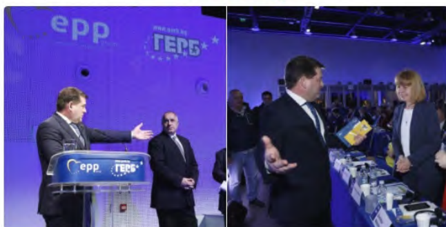
10:44 AM - 9 Mar 2018

Ahead of the #EP2019 we must win the hearts and minds of the European citizens and the grassroots engagement initiative of @EPP_CoR is the right kind of tool. Town hall meetings and honest conversation is what #Europe needs now. #EPPLocalDialogue